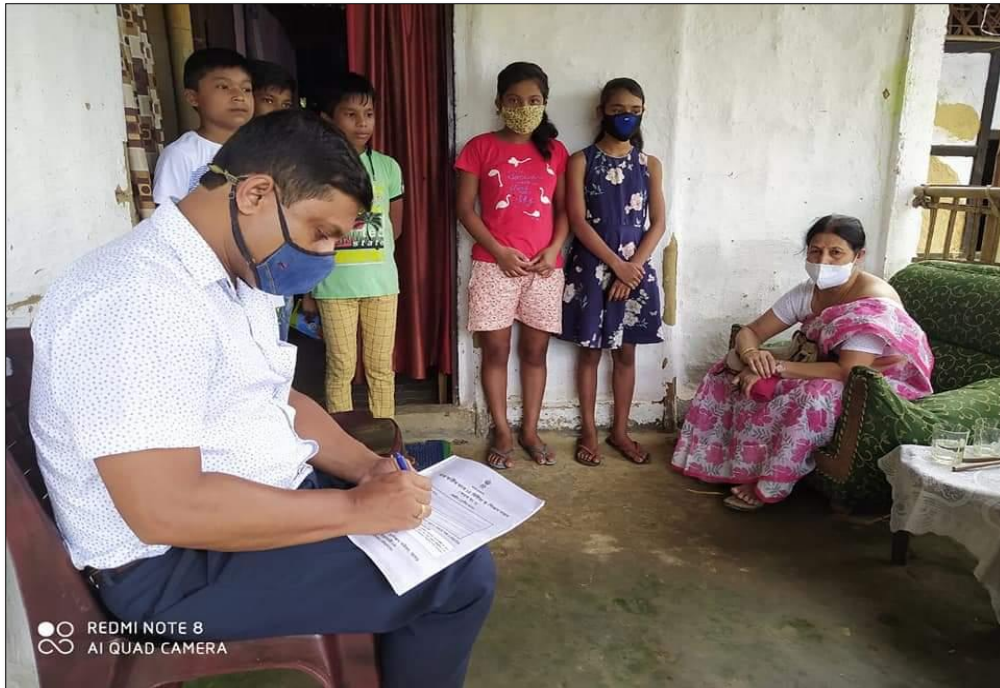
Door-to-door classes during pandemic

During the pandemic, school management organized numerous video conferences with the students to reinforce positivity within them and keep their studies on track. Teachers also conducted door-to-door classes for those who have no smartphone